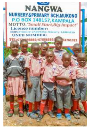
Pupils At The Sign Post (Nursery)