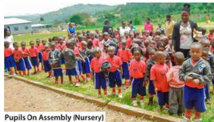
Pupils On Assembly (Nursery)